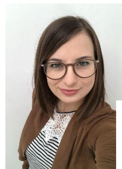
Above Eye Level