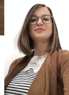
Below Eye Level